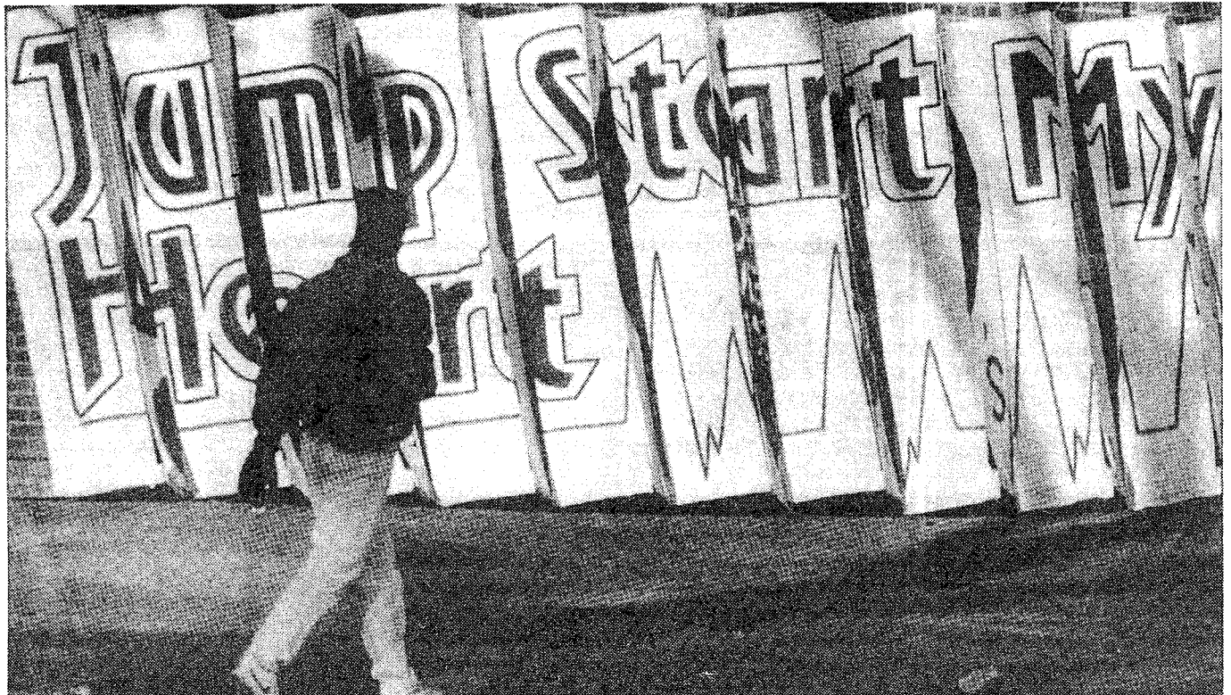
A pedestrian does a double take at a sign that appears to be a Valentine's Day greeting, but is really a Cardiac Care Week reminder at the Delta Tau Delta house on University Avenue in Grand Forks. Front, page Grand Forks Herald , 2/12/90.