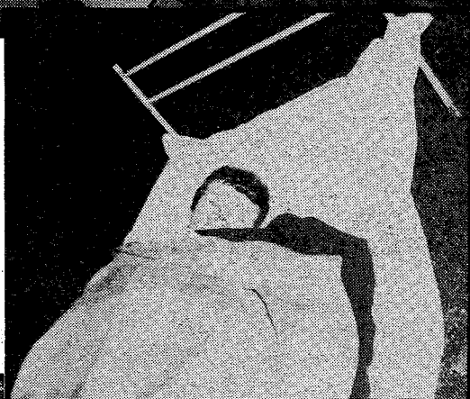
I want to be a CPA.