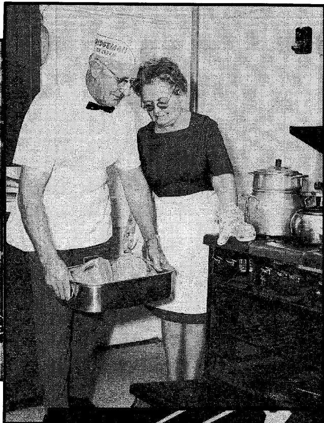
The best cooks in the world.