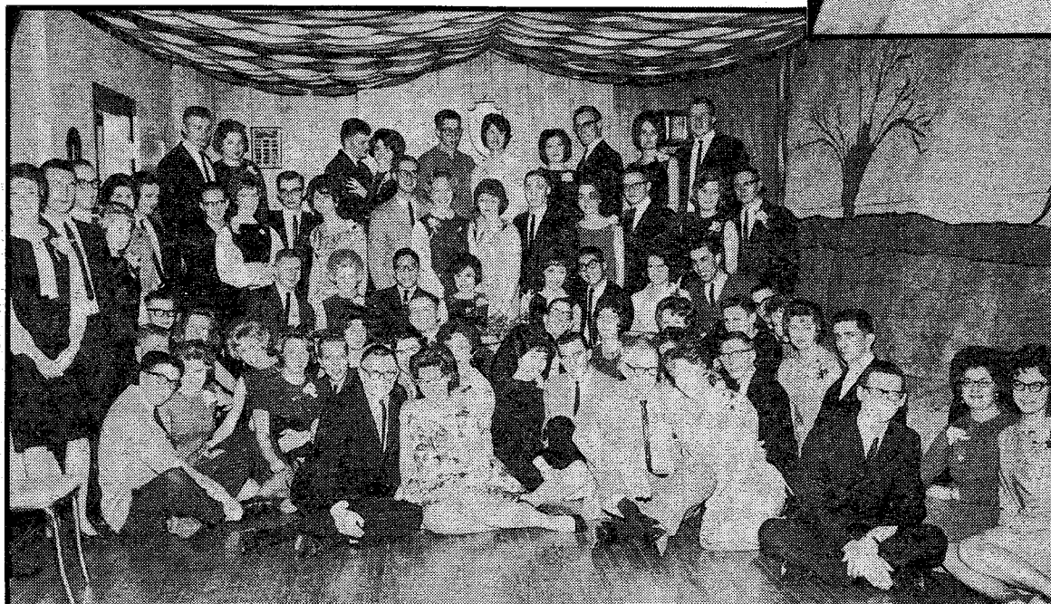
Pledge Princess '64